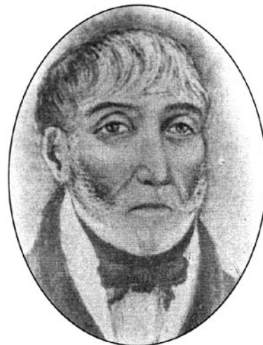
José María Narváez