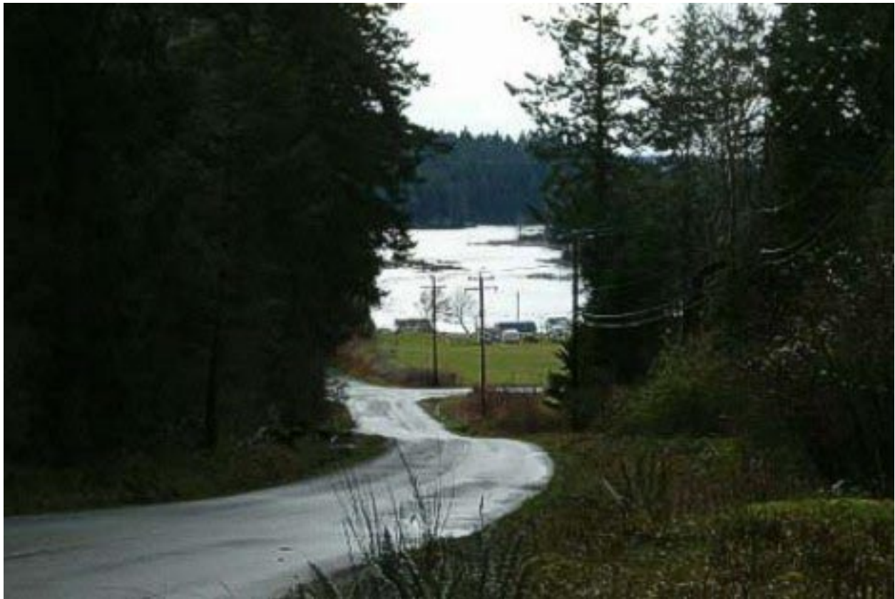
Looking down Preacher's Hill to Degnan Bay

This hill at the south end of Peterson Road rises up from South Road. Before the last section of North Road was finished in the '70s, folks heading to Silva Bay from the ferry would take Peterson to South and then on to Silva Bay. One wet spring, the Preacher who came to give the service at the Log Church, got stuck in the mud on his way back home. Of course, some locals came and pulled him out—with horses I was told—and the hill became known as Preacher's Hill after that.