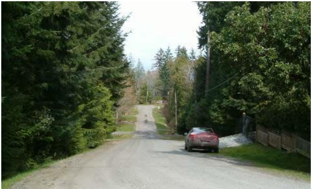
The view from the top of Rosislos on a hazy day