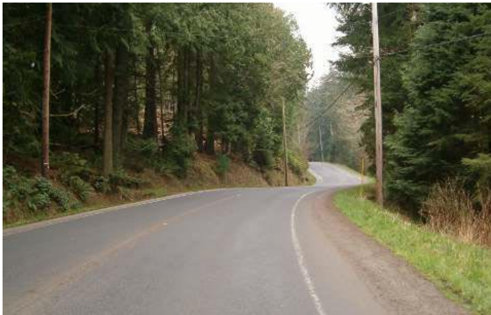
North Road as it heads up McClay Hill

This hill on North Road has a history worth noting. Although often mistakenly called ‘Horseshoe Hill’, this is where North Road really started. McClay Hill starts just past Bertha—if you are heading towards the South End—just past where old ‘Centre Road’ used to cut along the top of the ridge that the hill runs down. Centre Road was the old logging road that right down the centre of the island, eventually connecting with Degnen Road.