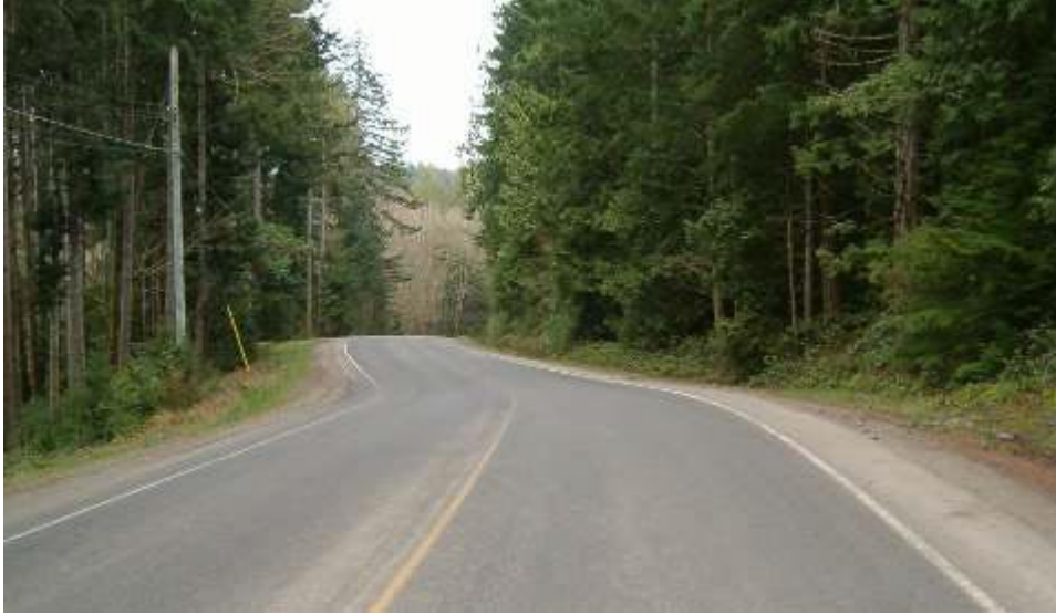
North Road as it heads down McClay Hill

When the time came to develop a real road to the south end, the road builders of the day chose to take the odd route down on to the lower shelf, following the laneway to the McClay Farm on the shelf of land that lay below the ridge. That meant North Road had to come up again (at Tait's Hill beyond Buttercup...another story) which was really not the best route for the main road.