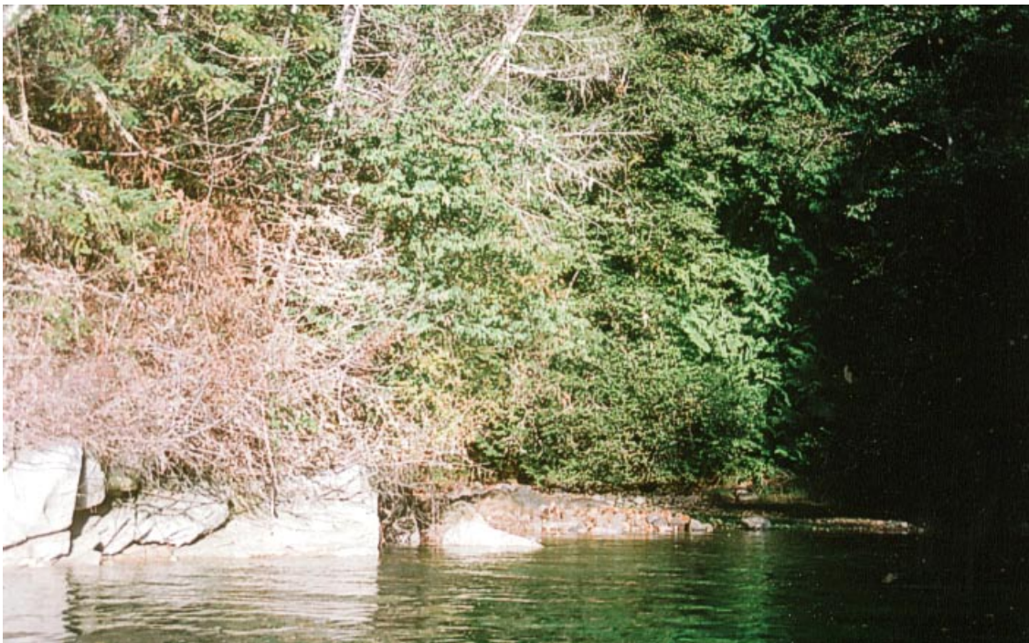
Above: Flea Village, unrecognized, picture taken in 2005.