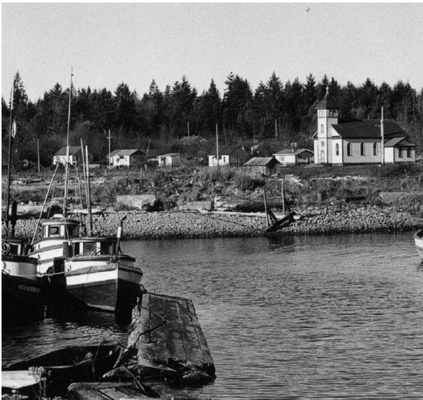
Teeshohsum in the 1960s. The main village of the Tla'amin people.

But it was all quiet, and I couldn't find