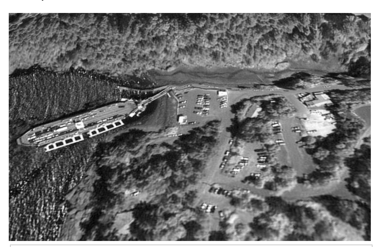
The Descanso Bay terminal and the Emergency Wharf in 2010.

[EDITOR: This is the first of six articles on Gabriola's wharves by Jenni Gehlbach.]