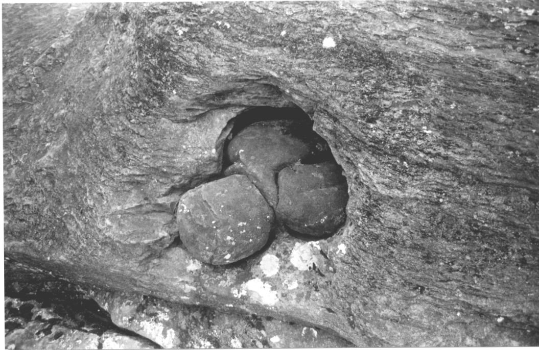
xuwtluqs in his stone prison on Berry Point

Although probably unrelated, it is interesting that the name the Spanish chose for Nanaimo harbour in 1791 was a similar sounding Winthuysen . 2