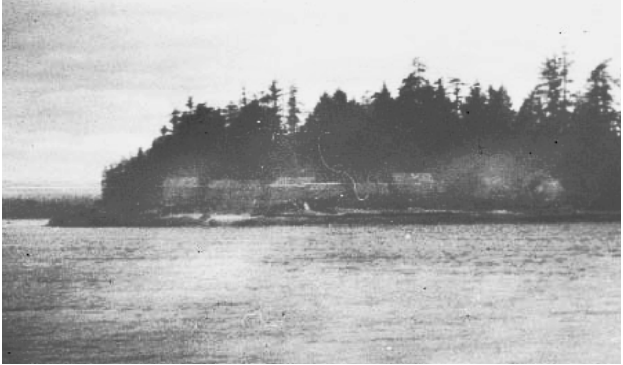
Royal British Columbia Museum

Thro' the mist—houses on Indian Point in the 1930s